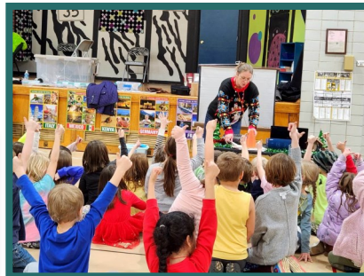
CHRISTMAS PARTY CLUB