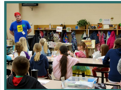
GOOD NEWS CLUB