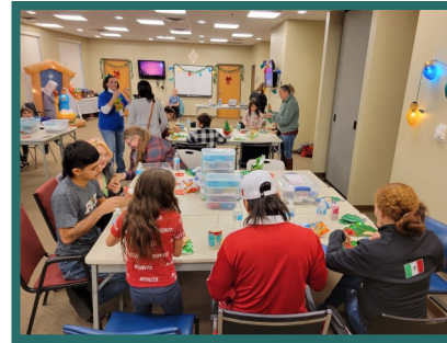
CHRISTMAS PARTY CLUB

We have over 3,400 workers worldwide led by eight regional directors. There are also tens of thousands of volunteers worldwide. God works through His people, godly leaders, staff and volunteers in order to accomplish our goals. The sun never sets on CEF ministry. We provide training, equip our workers with ministry tools and support them through fund-raising and ministry development.