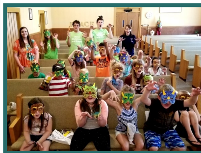
DINOSAUR TRACKS PARTY CLUB