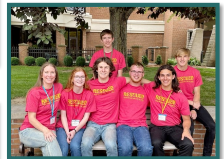
CYIA TEAM 2022