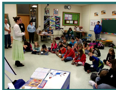
GOOD NEWS CLUB