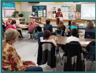
GOOD NEWS CLUB