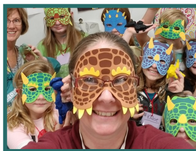
DINOSAUR TRACKS PARTY CLUB