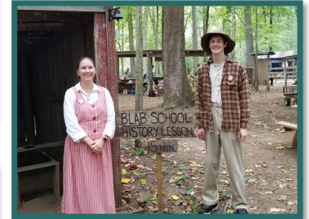
TRAIL OF COURAGE