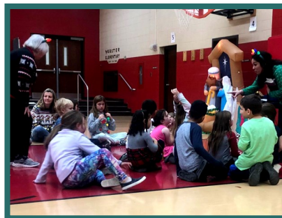
CHRISTMAS PARTY CLUB