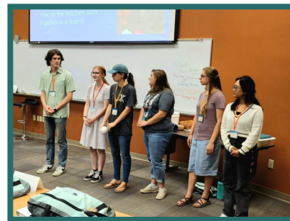
ADVANCED SUMMER MISSIONARIES