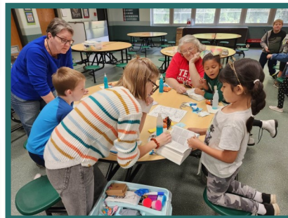
GOOD NEWS CLUB